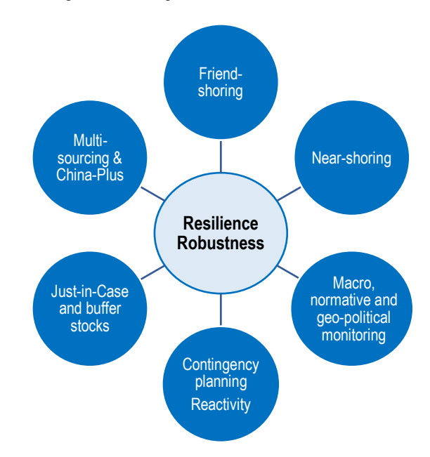
Figure 3 Strategies for building Global Value Chain resilience and robustness

BCDR, a management concept, became an agenda item for policy makers in the post-COVID19 era, when geo-political risks became the focus of interest of national policy makers. It has been reported that Germany's foreign ministry plans to tighten the rules for companies deeply exposed to China, making them disclose more information and possibly conduct stress tests for geopolitical risks<sup>10</sup>. When incorporating geo-political risks, international supply chain resilience and robustness strategies are usually developed according to several directions, as in Figure 3. The focus of attention is usually on supply chain (upstream linkages); much less analysed by scholars is the downstream risk of being prevented from selling to main markets, as occurred to the Huawei company (see Escaith 2021, for evaluating both upstream and downstream risks).