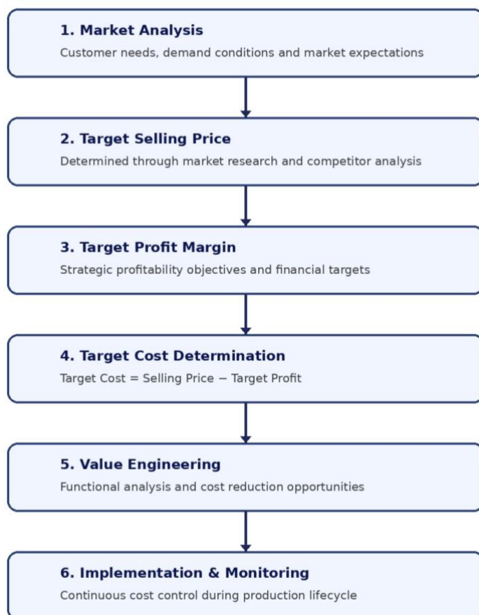
Figure 1. Target Costing Implementation Framework

The operational stages of the target costing methodology applied in this study are summarized in Figure 1, which illustrates the sequential process linking market analysis, target cost determination, and value engineering activities.