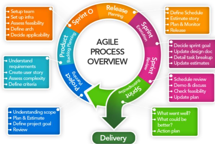
Figure 1: Agile methodology frameworks

A variety of tools and technologies were employed to ensure the successful development of the mobile application, with each tool chosen for its specific features, compatibility, and contribution to the overall project goals.